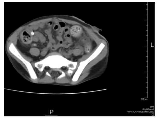
Fig 2: Abdominal CT showing clustered small

bowel loops within a peritoneal sac like structure, a flattened terminal small bowel and dilatation of the rest of the small bowel