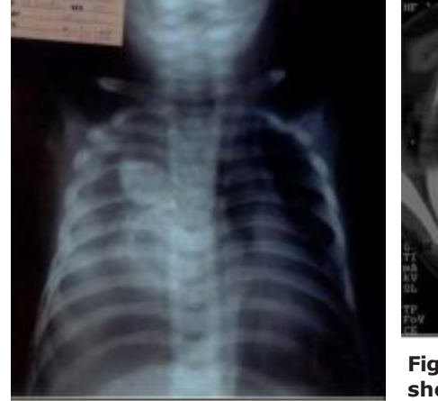
Fig. 1: X- ray chest showing coarse calcifications in right thoracic paravertebral region.

a chylomicron band. All these investigations were conclusive of chylothorax. Contrast enhanced CT chest revealed a large (5.3x5.8x7.5 cm) well defined heterogeneous contrast enhancing mass containing coarse calcification in paraspinal region of upper half of thorax, extending into spinal canal (T2-T5) and displacing the mediastinal structures (Fig. 2) suggestive of neoplastic etiology (most probably neuroblastoma). CT abdomen and head were normal. CT guided fine needle aspiration cytology (FNAC) showed few sheets of small monomorphic round cells with hyperchromatic nuclei having evenly distributed chromatin without prominent nucleoli associated with