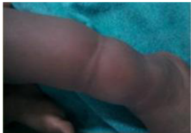
Figure 2. Right hand showing complete loss of index finger and amputation of ring and little finger at distal interphalangeal joint.