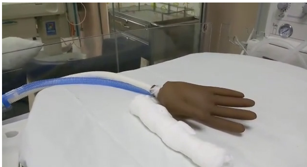
Figure 3. The air-filled glove was kept under the baby's nest.