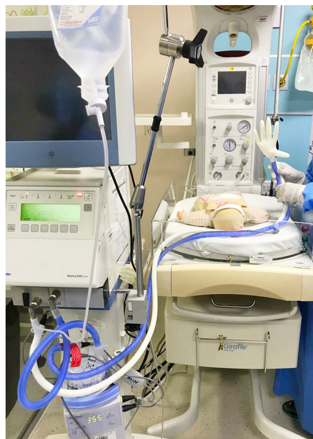
Figure 1. The end delivery limb of the ventilator tubing.