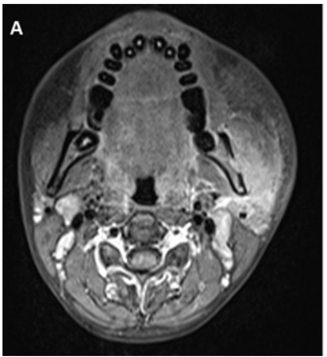
Figure 1. MRI showing an ill-defined lesion involving the masseter muscle and the mandible, with heterogenous hypersignal in T1 (A) and anomalous hyposignal of the bone (B).

muscle and the mandible ramus, with bone erosion and periosteal reaction (Figure 1), along with a small amount of air on the left third molar root. Although an infectious cause was more likely, a neoplastic etiology could not be excluded. Therefore, she underwent both fine needle aspiration and ultrasound guided biopsy, which were not conclusive, showing only inflammatory cells. All cultures of the collected material and PCR for bacterial DNA and fungi were negative. Surgical biopsy of the mandible and masseter muscle was then performed, along with extraction of the third molar, and Actinomyces odontolyticus was isolated in the samples. She received intravenous amoxicillin + clavulanate and clindamycin empirically for four weeks, with clinical