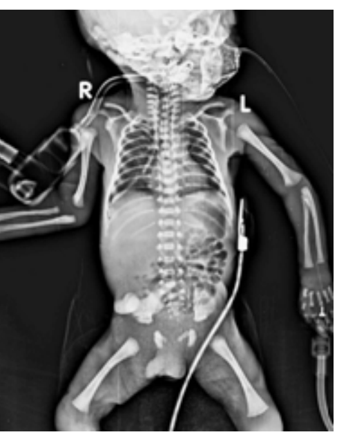
Figure 2. Water soluble contrast leaked into mediastinum