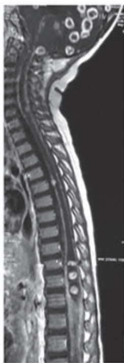
Figure 2. MRI spine showing spinal granulomas