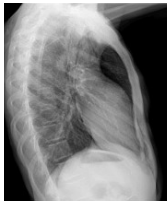
Figure 2. CT Chest