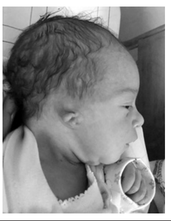
Figure 1. Grade III microtia: hypoplasia of the pinna with a small peanut-like vestige associated with atresia of the external auditory canal

renal fossa on the right side. Thoracic computed tomography (CT) scan confirmed the presence of rightsided diaphragmatic Bochdaleck-type hernia associated with trans-diaphragmatic intrathoracic ectopic right kidney (Figure 3). Temporal bone CT on the right side showed agenesis of the external auditory canal, small opacified middle ear cleft, incudo-malleolar ankylosis, agenesis of the oval window, non-pneumatized mastoid, narrow internal auditory canal with normal appearing semicircular canals, vestibule and vestibular aqueduct. Tympanic portion of the seventh cranial nerve was not visualized. CT scan imaging of the left ear was normal. Cerebral CT confirmed the presence of membranous choanal atresia. Echocardiogram revealed patent foramen ovale and ductus arteriosus. On the basis of the above-mentioned findings the patient was diagnosed to have atypical CHARGE syndrome. Genetic testing could not be performed due to unaffordability. The respiratory symptoms resolved by 12 hours and oxygen administration was discontinued. The infant was discharged at one week of age and followed-up on an outpatient basis.