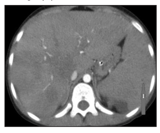
Fig.4 - Computerized Tomography abdomen showing tiny splenic abscess