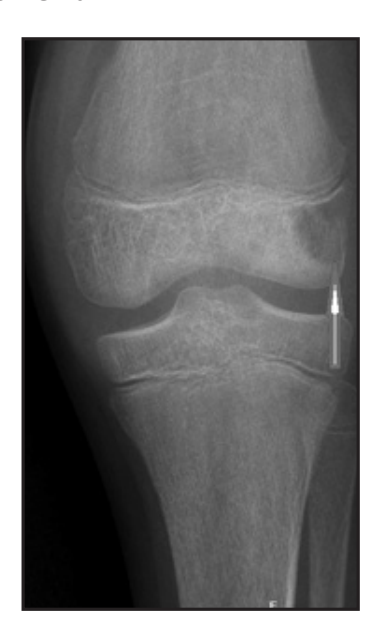
Fig.1- X-ray showing osteomyelitis of lateral condyle of femur.

Case 3: A 14 years old girl, suffering from systemic lupus erythematosus (SLE) and on treatment with 1mg/kg/day of prednisolone on alternate day presented with fever and right knee joint pain for 10 days in August 2015. Examination revealed right knee joint effusion. X-ray showed minute lytic areas in proximal tibia (Fig 5). Decompression and debridement of right proximal tibia was done. On day two of the procedure, she developed worsening cough and respiratory distress. Her Blood culture grew B. pseudomallei and she was started on IV Ceftazidime and Meropenem due to her rapidly worsening condition. She was put on mechanical ventilation but succumbed to her illness on day 3 of admission.